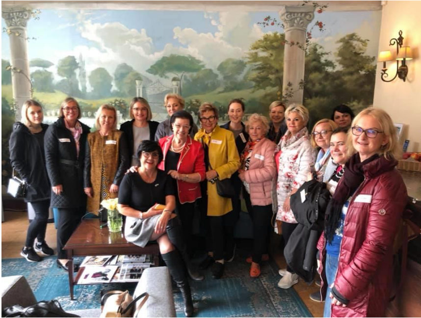
Meeting in the HOTEL WŁOSKI Poznan