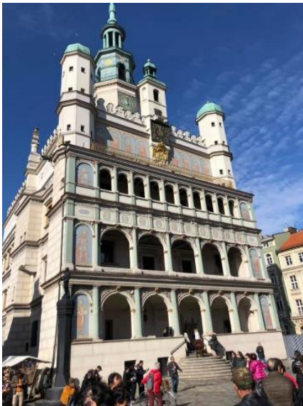
The beautiful city of Poznan The Old Square